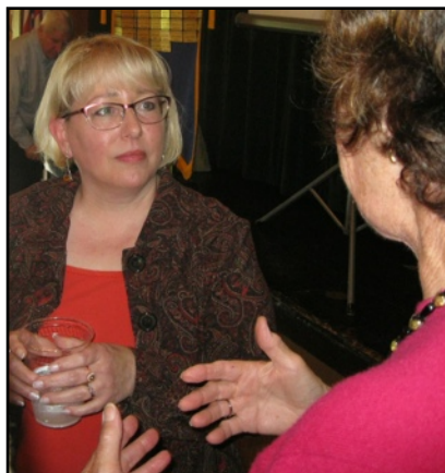
► What's this—our guest speaker drinks iced tea?