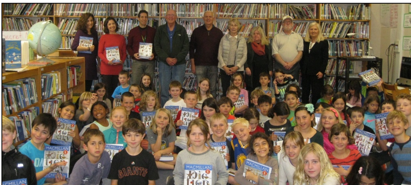
► Third Graders at Old Mill School pose with their new dictionaries after their presentation yesterday. MV Rotarians participating in the ceremony stand at back along with the three Third Grade teachers.