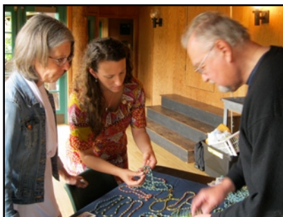
African trinkets tempt PP Ed.