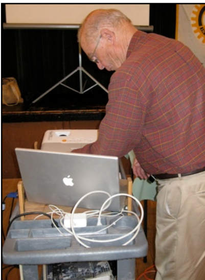
Today's Mystery Rotarian helps close up shop after the meeting.