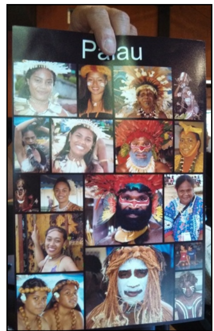
☛ Montage of visit to Palau.