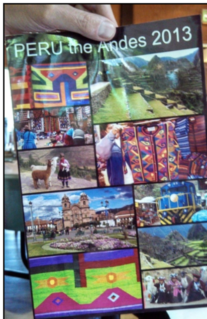
☛ Duncan's Peruvian montage.