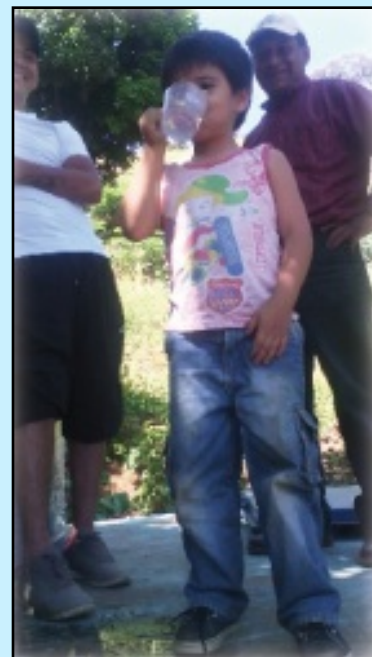
► Finally, safe to drink!

The next phase of the project will include household sanitary education in each of the five communities. Benefits of clean water and proper hygiene practices will be highlighted.