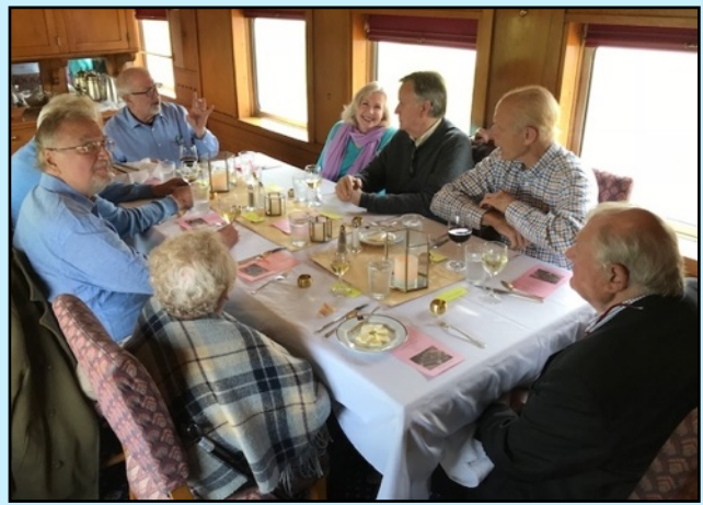
► Who's picking up the tab? Uncle Dick or Uncle Peter? Either way, all passengers report that all of the food served was excellent.