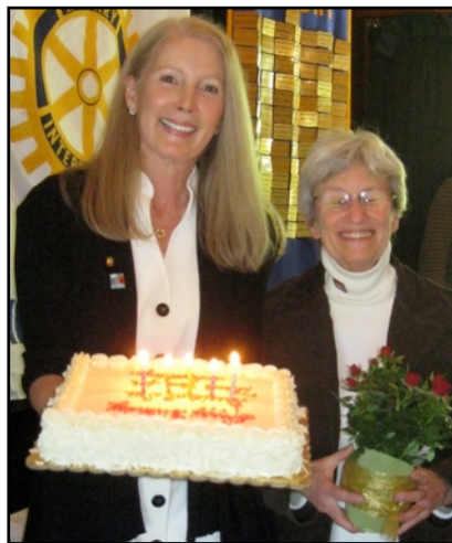
☛ The club surprised our Number One Birthday Girl with a cake and flowers.