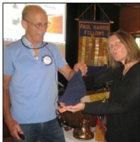
...A magician with a bag of raffle marbles.