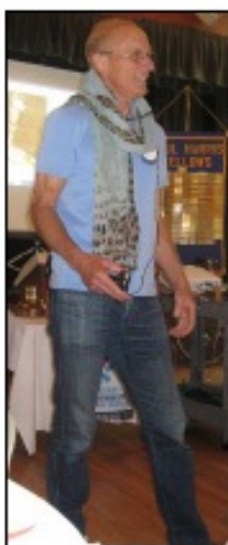
...A classy dresser.