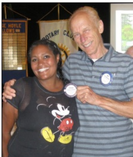
...A knack for making new Blue Badgers feel right at home.