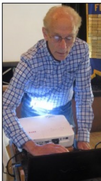
...Master of the PowerPoint.