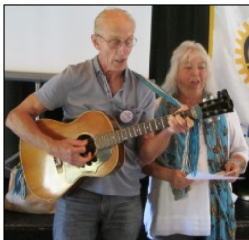
...And, to top it off, he wields a wicked guitar!

IN OTHER WORDS, THE PERFECT FIT AS PRESIDENT OF THE ROTARY CLUB OF MILL VALLEY IN THIS WEIRD, YET WONDERFUL 2019-2020 YEAR!