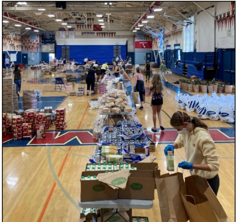
► Above: Tam High gym is a busy PTA Food Pantry as volunteers, some from the Interact Club, fill bags for the needy. Below: Fresh produce and all, bags ready to go.

◆ Since then, they have partnered with the Marin Food Bank, moved the Pantry to Tam High, and increased distribution from 55 families to over 300 each week. Rotary has been there every step of the way, Emily reports, with many Interact High School Club members helping to unload, pack, and distribute food. "We've also participated monetarily, first donating 500 rolls of toilet paper to be included and most recently, donating $5,400 to the distribution effort," she added. Emily says Rotarians are welcome to swing by the Tam High gym to help with the pop-up pantry on Fridays between 9-2:00 PM.