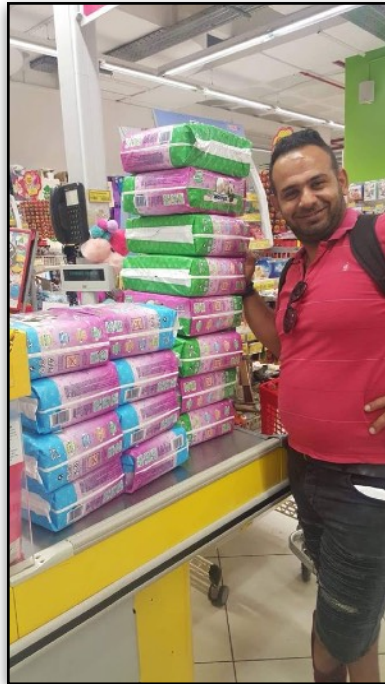
Diapers for refugee children.