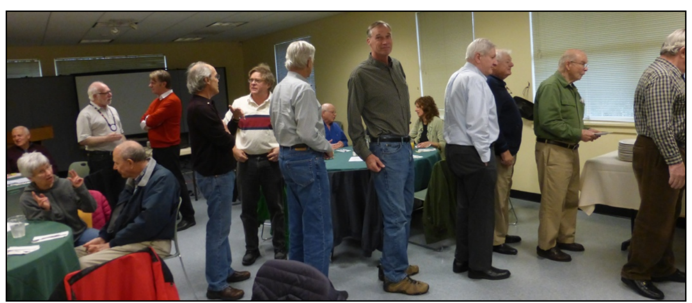
Rotarians line up for chow in the Mt. View room of the Community Center.