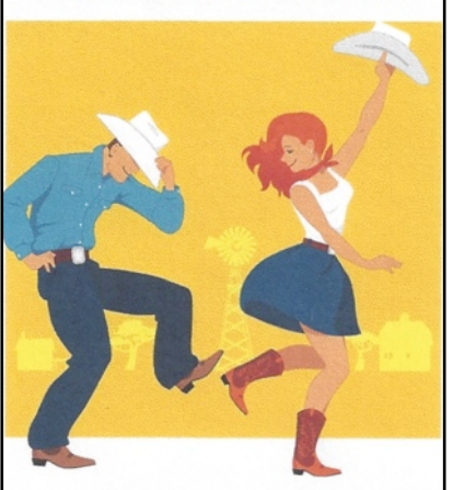
Tuesday, October 20, 2015 5:30 to 9 p.m.

Bay Model Visitor Center 2100 Bridgeway, Sausalito