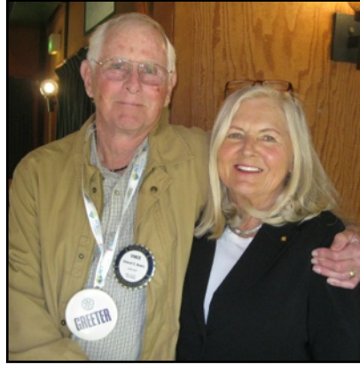
► The greeter and the greetee.

The senior Patton had dyslexia, was a pentathlon athlete (five different events including shooting