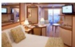
Mini-Suite from $699