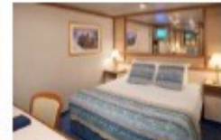
Interior from $299

Govt. Fee's $140 pp additional Return air from Vancouver from $166 Deposit: $100 pp (refundable) Final Payment: February 1, 2020