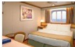
Oceanview from $399