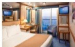
Balcony from $549