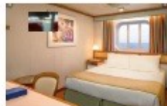
Obstr. Oceanview from $349