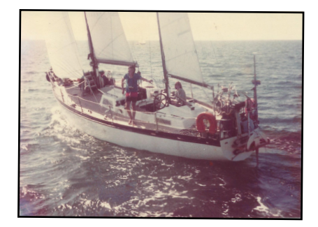
► The Cowabunga at sea.

Through their adventures and misadventures, tragedies, and glories across four continents, the Couvreux family rarely had a dull moment living on the water. Janis chronicled in vivid and lively detail how they fended off a