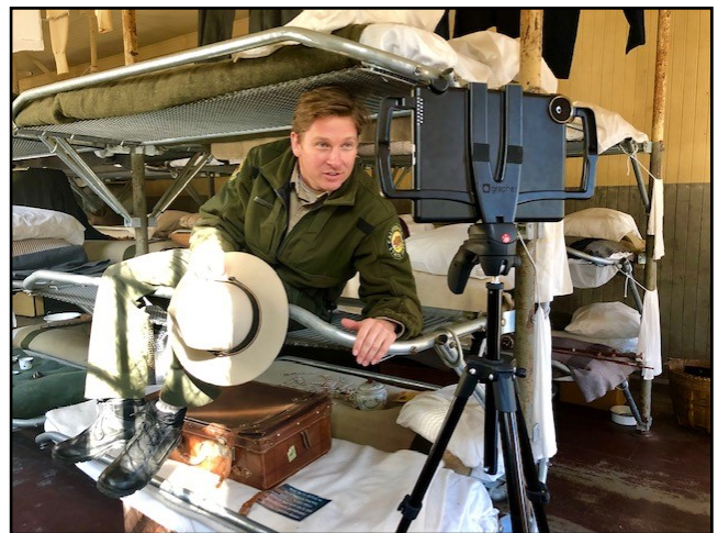
► Not much headroom but they worked for the immigrants who came to Angel Island.