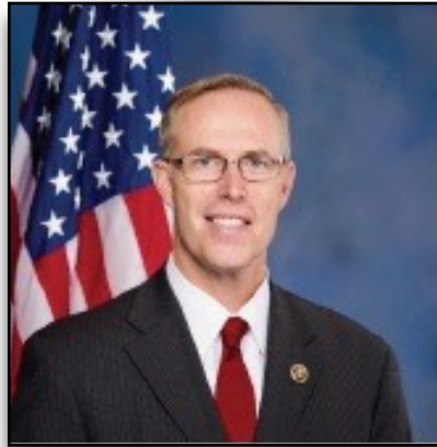
Congressman Jared Huffman