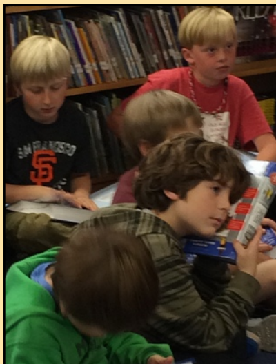
☛ Old Mill School.

■ The last of 362 MacMillan Illustrated Dictionaries for Children was distributed last Monday to a 3rd Grader at Park School, marking the completion of this year's Dictionary Distribution Program sponsored by MV Rotary. All 3rd Graders in Mill Valley elementary schools—Tam Valley, Old Mill, Park, Edna Maguire and Strawberry Point—received one of the books.